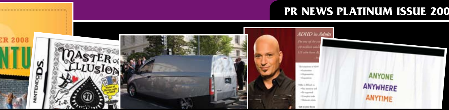
(campaigns, left to right): GolinHarris & Nintendo, Bright Automotive & Rational 360, Porter Novelli & Shire Plus, Alembic Health Communications & National Meningitis Association

Chicago Office of Tourism executed a successful phased media relations campaign that supported the citywide summer 2008 tourism initiative, garnering 4.6+ million media impressions.