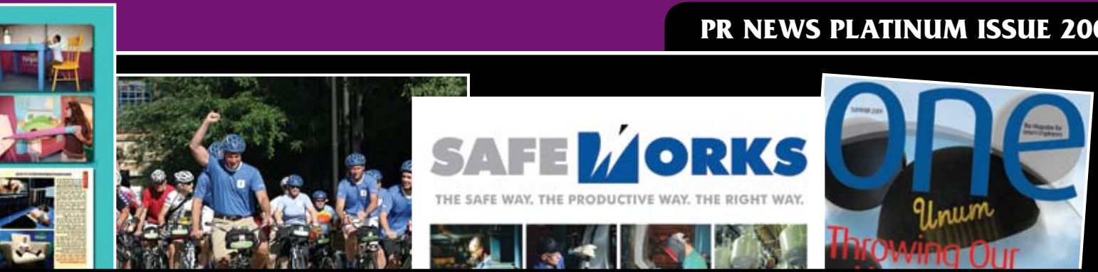
(campaigns, left to right) Humana & Coyne PR, Fahlgren Mortine & Worthington Industries, Unum

2008, which featured the World's Largest Spread—a collection of 600 dishes using Promise margarine.