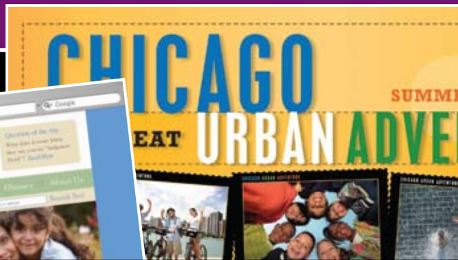
(campaigns, left to right) Lion Brand Yarn, ACA International, Chicago Office of Tourism

stories to firm culture pieces to employees based in 27 cities around the world.