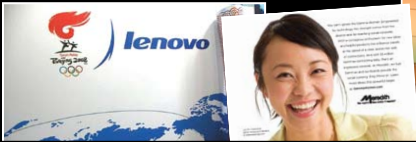
(campaigns, left to right) Lenovo, Meredith Publishing, Grand Central Marketing & Meow Mix

signed its Web site to highlight CSC's experience within the federal sector, resulting in a 270% increase in page views over a two-month period thanks to SEO.