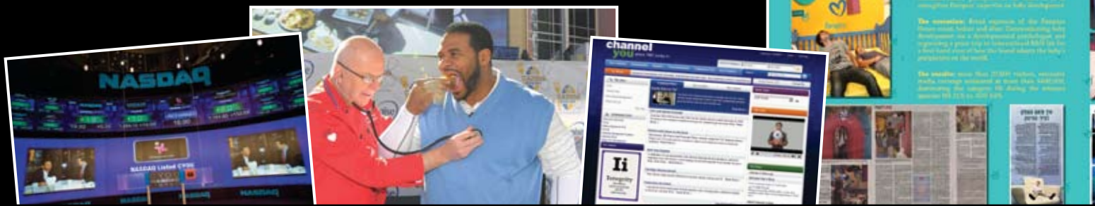
(campaigns, left to right) CCG IR, Ogilvy PR & Promise, Time Warner Cable, Stern Ariely PR & Pampers

hit the Midwest, Vectren implemented the “Neighbor to Neighbor” program, mobilizing volunteers to knock on the doors of more than 14,000 homes.